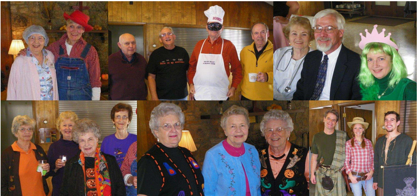
Snapshots from the Ageless Adventurers Halloween Party